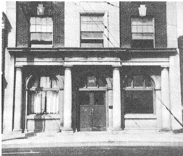
1170 Yonge Street, handy to the liquor store and railroad station just across the street, was the home of Toronto's beloved A.A. clubhouse from 1944 to 1960.

Registration forms listing available hotel accommo-